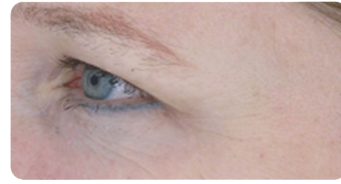
After 4 Weeks