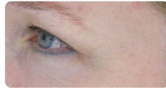
After 12 Weeks