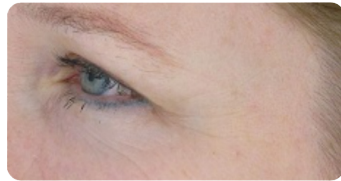
After 8 Weeks